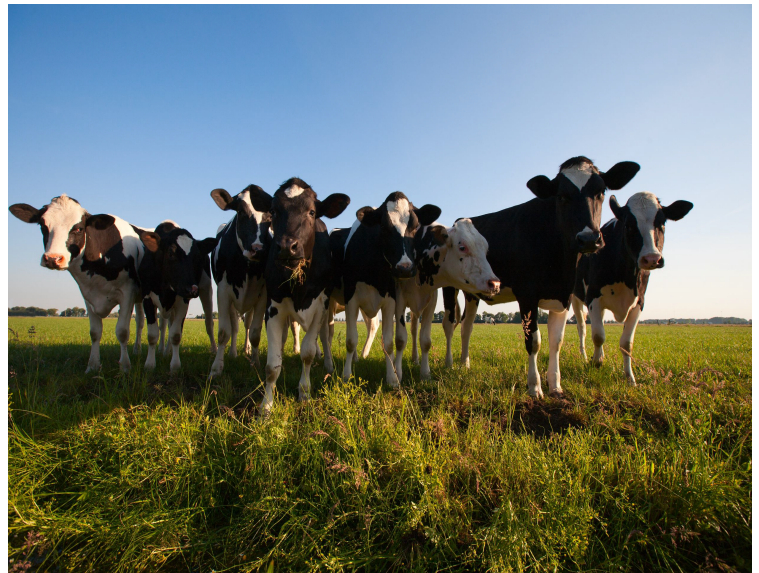
PHOTO CAPTION: Animals Live by Instinct but man was created with mind. Man must CHOOSE the way he will live. Choosing the way of disobedience to God's Law brings suffering and death. But the way of OBEDIENCE to God's Law brings true happiness and contentment.

1. After creating Adam, did God place him in the Garden of Eden? Gen. 2:8. Then what did God give him PERMISSION to do? Verse 16.